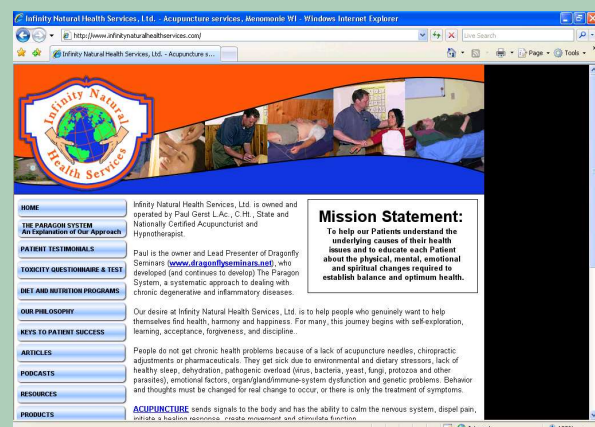
Infinity Natural Health Services • infinityhealthservices.com