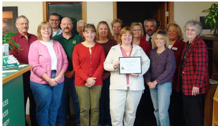
Pictured team members of DCS Netlink and the "Red Coats" from the Rice Lake Chamber of Commerce. "Certificate of Membership" Presented to DCS Netlink Membership since 1991