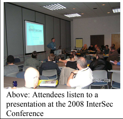
Above: Attendees listen to a presentation at the 2008 InterSec Conference

DCS Netlink has partnered with Wisconsin Indianhead Technical College (WITC) and Chippewa Valley Technical College (CVTC) to host the annual InterSec 2009, Internet Security Conference.